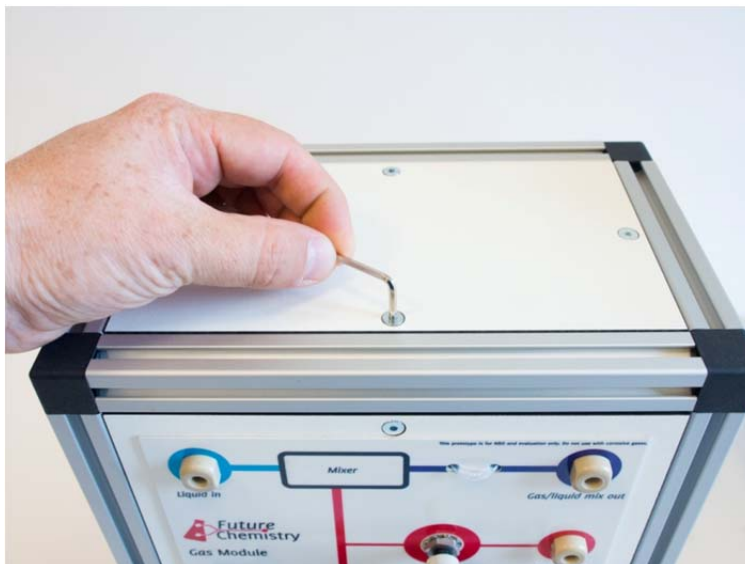
Figure 1.1: Disconnection of the top plate.

The mixer can be replaced by removing the top plate (see Figure 1.1). Next remove the mixer by disconnecting the mixer as depicted in Figure 1.2.